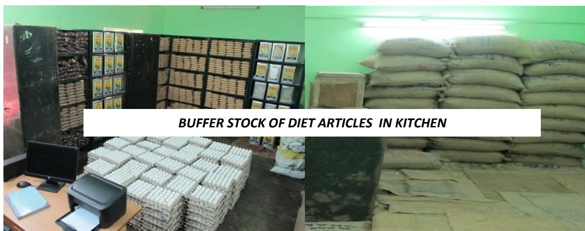
BUFFER STOCK OF DIET ARTICLES IN KITCHEN

The diet and non-diet articles in respect of Puducherry, Karaikal, Mahe and Yanam regions are being supplied by M/s. Pondicherry co-operative Wholes stores Ltd., Puducherry Agro Products Food And Civil Supplies Corporation Limited, Puducherry Central Co-operative Processing Supply and Marketing Society, Karaikal Central Co-operative Processing Supply and